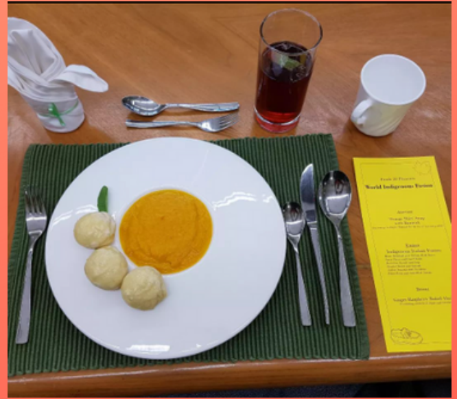
"Orange Shirt" Soup with bannock

Foods 30 students with the support of Foods 10 and 20, created and served a three course meal for our guests. The theme, World Indigenous Fusion, highlighted different ingredients that have value to Indigenous people in different parts of the world. From beans and squash (two of the Three Sisters used by the southern and central aboriginal peoples), tomato bush tomato sauce (from Australia), bison from our prairies and bannock which has become a traditional food used by many of our First Nations People, were incorporated into the dinner. The "orange shirt" soup paid homage to Orange Shirt Day which preceded the dinner the week before. Baked Alaska (with ginger ice cream and a raspberry sorbet) represented the Japanese flag and the hand piped maple leaf for Canada represented the bond between our guests and ourselves.