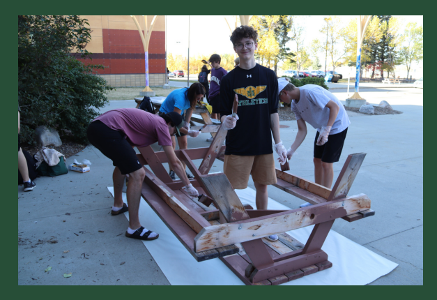
Students helped paint the picnic tables - they look great!