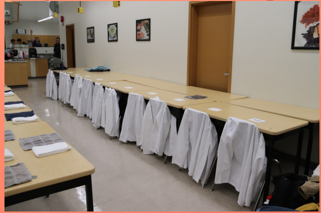
Indigenous Italian Fusion