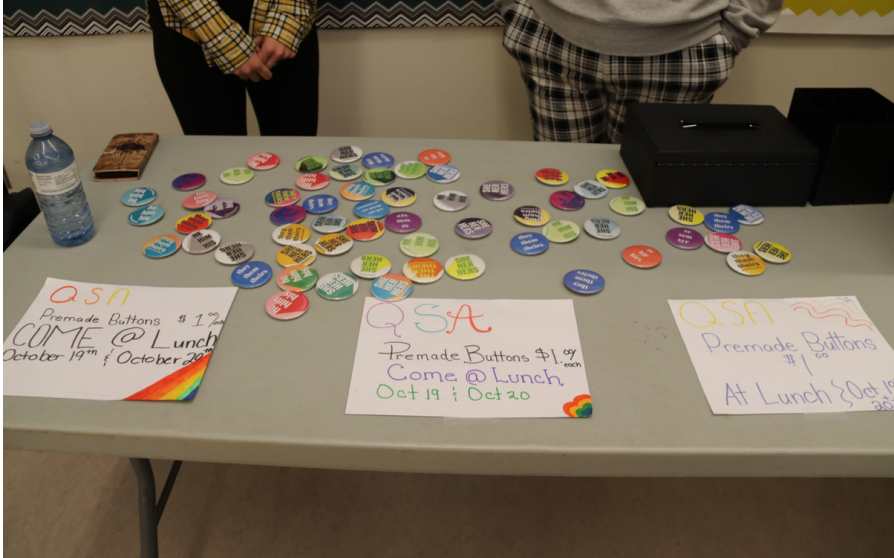
Students made and sold buttons in support of International Pronouns Day