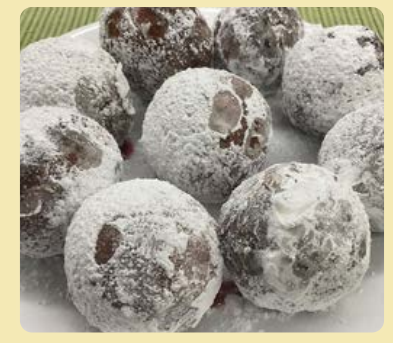
Doughnut Day- Traditional, jelly and Italian