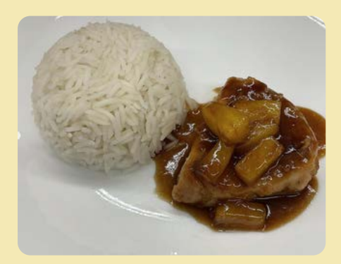
Sweet and Sour Pineapple Pork Loin with Rice