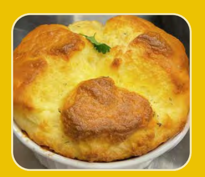
Cheese and Herb Soufflé