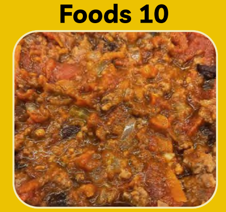
Chili - seasoning