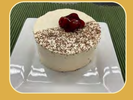
High Ratio Vanilla Cake with Italian Buttercream