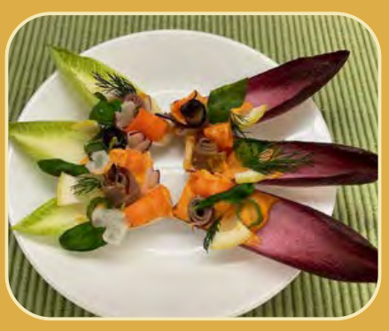
Appetizer Salad in Belgian Endive