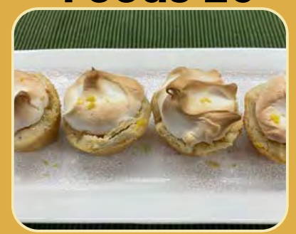
Lemon Meringue Tarts Foods 10